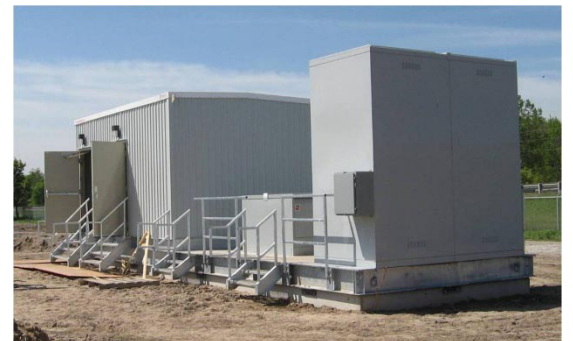
PV Interconnection Switchgear

There will be two PV Interconnection Switchgear (PVIS) houses for St. Clair – Sombra. Each PVIS house is approximately 3.6 meters in height and is elevated 500 mm above grade. The PVIS houses will be located near the connection point to the local grid. A 27.6 kV high-capacity collection system line will then connect the power output from the PVIS to the Project Substation.